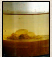
Contaminated Fuel Sample